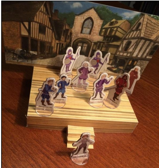
Stage in use