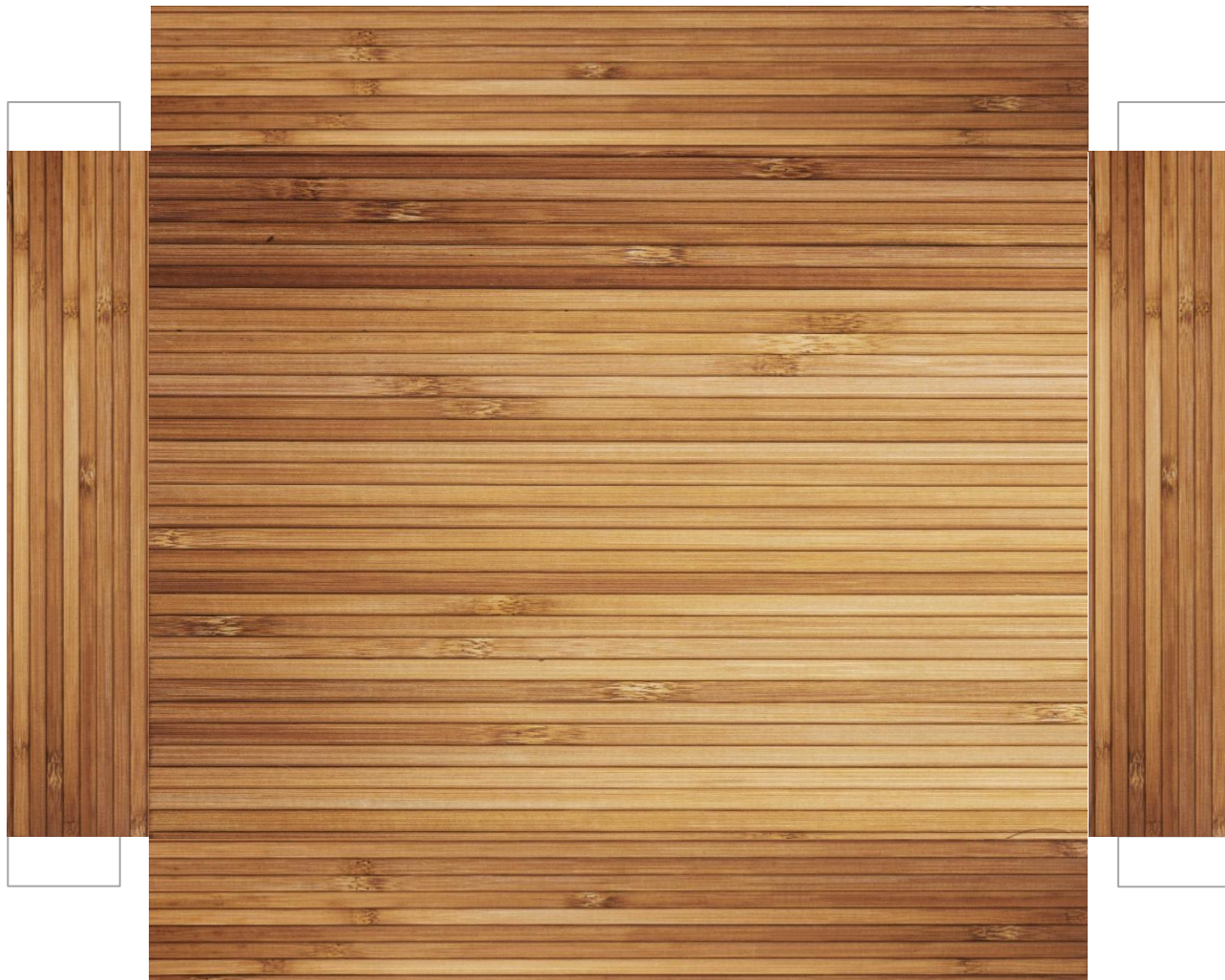
Stage 20' x 15' (6m x 4.5m)